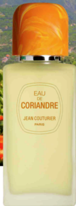
EAU de CORIANDRE JEAN COUTURIER PARIS